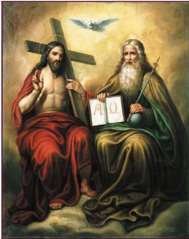
The Most Holy Trinity

Rectory Office Hours: Monday—Friday 9:00 a.m. to 5:00 p.m.