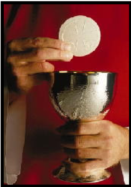
The Most Holy Body & Blood of Christ